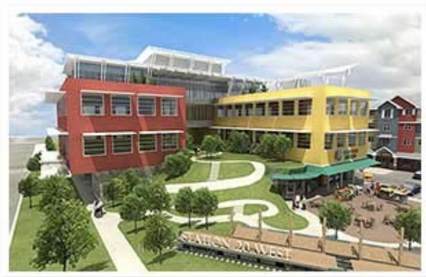
Station 20 West