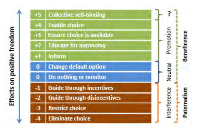
Figure 2 Assessing the effects on positive freedom using Griffiths and West's (2015) intervention ladder

Based on this positive conception of freedom, Griffiths and West suggest an alternate way of classifying the interventions targeted by the Nuffield Council on Bioethics (and add three more categories). At the bottom of their ladder, they place interventions that interfere with freedom, namely, those that encourage, discourage, restrict or eliminate options. In the middle of their ladder are options that would have no impact on freedom. namely the absence of intervention, monitoring or the replacement of one default option with another. Finally, at the top of the ladder are interventions that would promote freedom by informing, educating for autonomy, ensuring an option is available, enabling choice and those resulting from collective selfbinding. We will return shortly to this last intervention category.